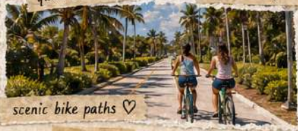
scenic bike paths