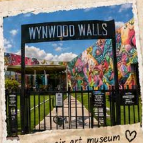
open-air art museum

★ Late morning is ideal: fewer crowds and softer heat.