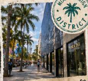
luxury · style · design