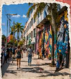
graffiti & good vibes