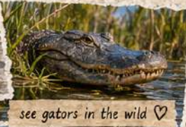
see gators in the wild